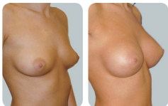
350cc round implants placed in front of the muscle